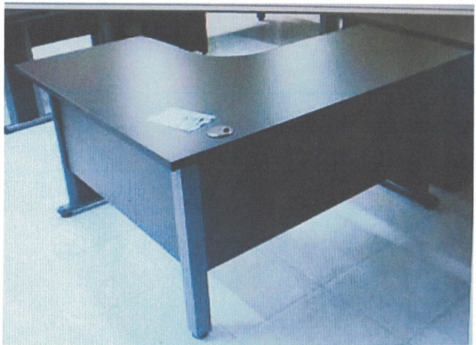
L-SHAPE TABLE with CENTER DRAWER SIZE: 140x60x120x45cm