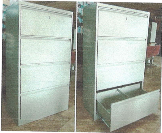
4 Drawers Lateral Filing Cabinet