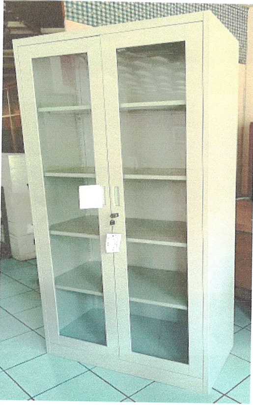
2 Doors Swing Doors Display Cabinet