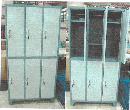
WITH HANGER ROD AND ADJUSTABLE SHELVES