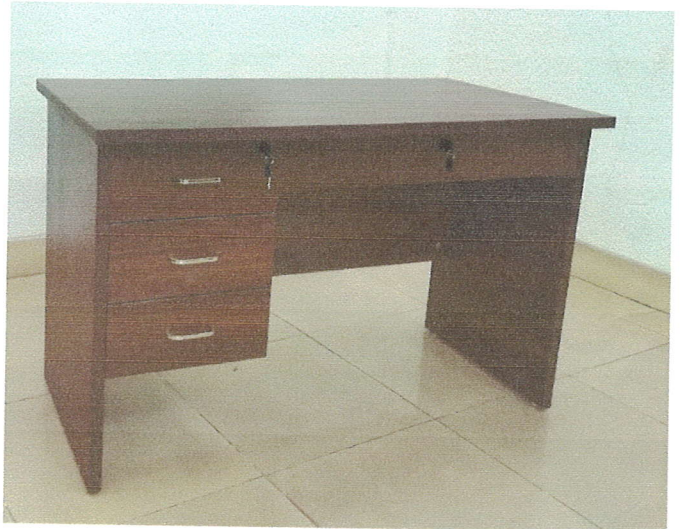
Office Staff Table with Fixed Center and Side Drawers