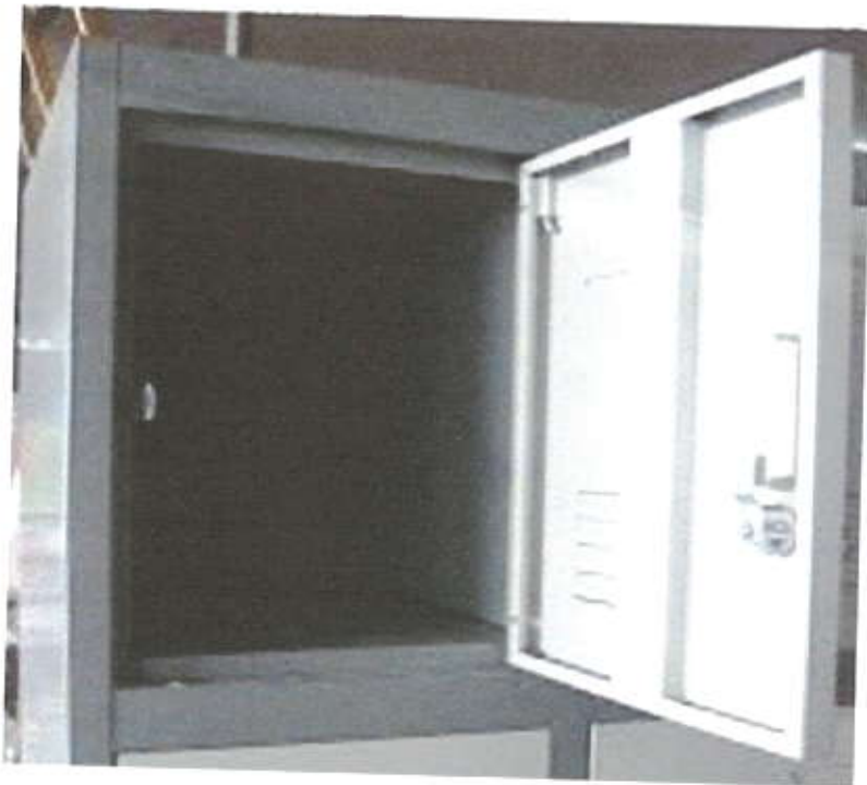
15 doors metal Locker