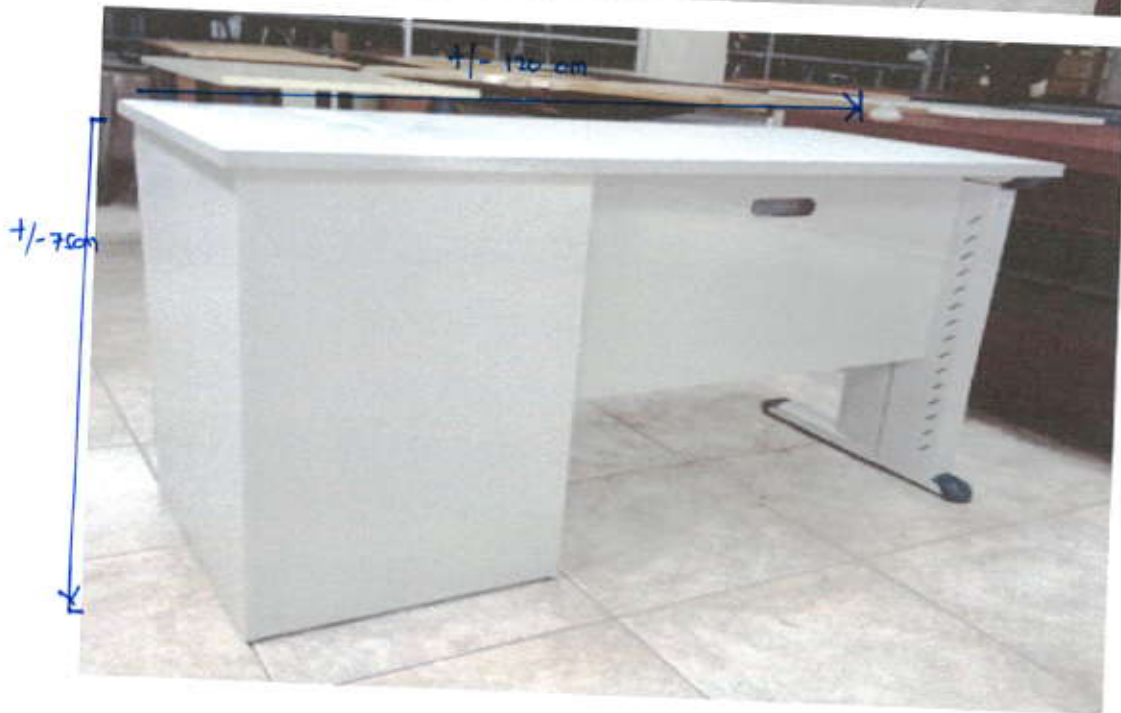
Office Table with 1 Center and 3 Side drawers